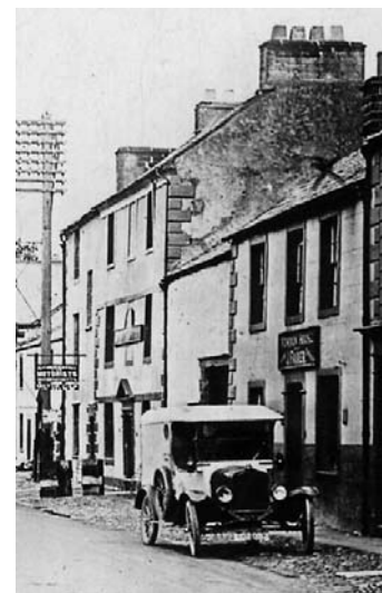
Upper photographs from different periods show the Queens Head as a hotel, the lower one shows the building as it looks today.